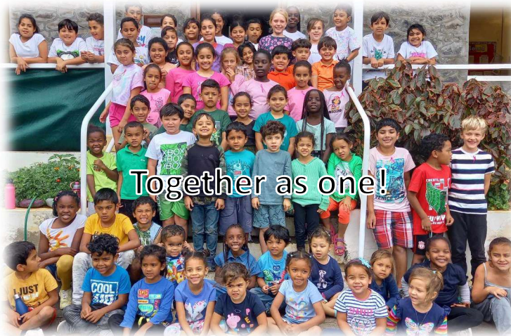
Together as one!