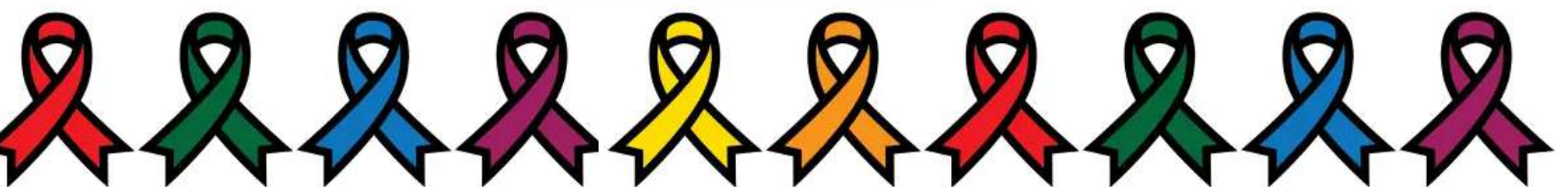
Pink: Breast cancer